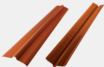
Ridges and Valleys